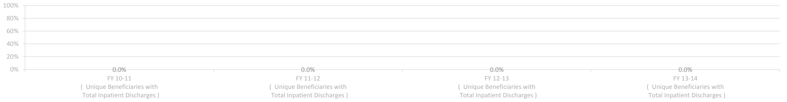
Percentage of Discharges by Time Between Inpatient Discharge and Step Down Service

TABLES AND CHARTS NOT PRODUCED FOR THIS INDICATOR DUE TO SMALL CELL SIZES.