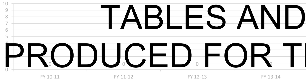
Median Time Between Inpatient Discharge and Step Down Service in Days