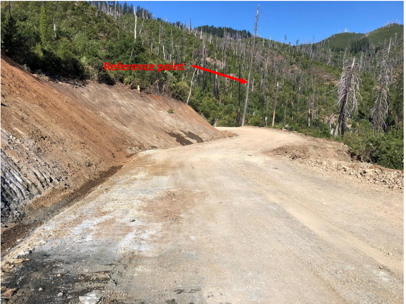
Lower South Fork; July 2023 Repair of Damage by County crews (waited for hill to dry ... )