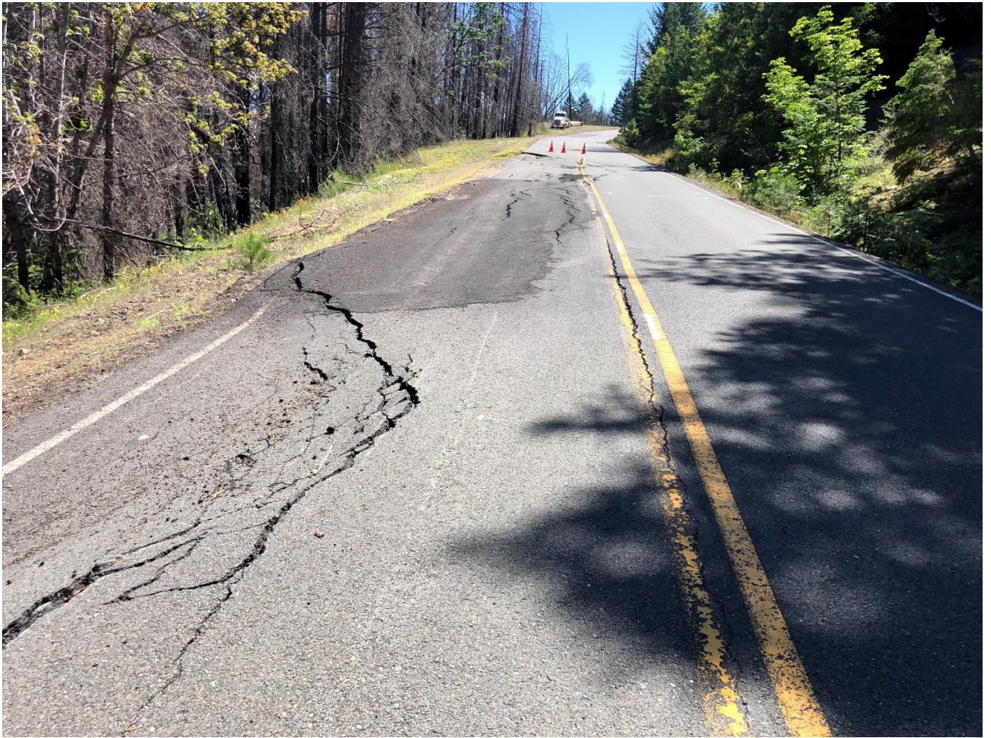
January 2023; Ruth-Zenia Road Damage