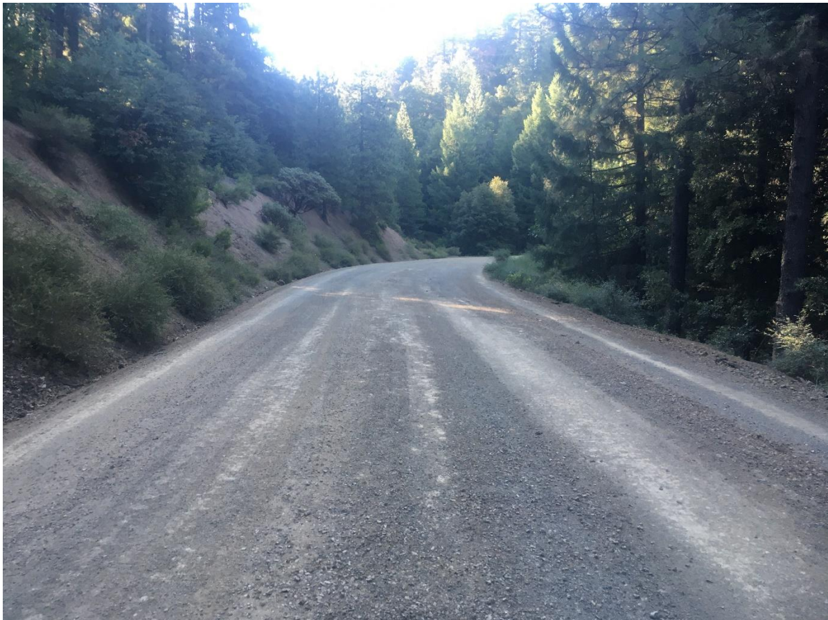
Post Mountain area roads - added material and graded by county crews