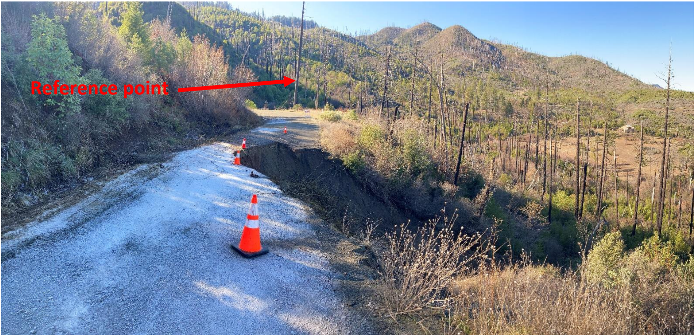
Lower South Fork; January 2023 Damage (3 to 5-foot unstable pedestrian path for access)