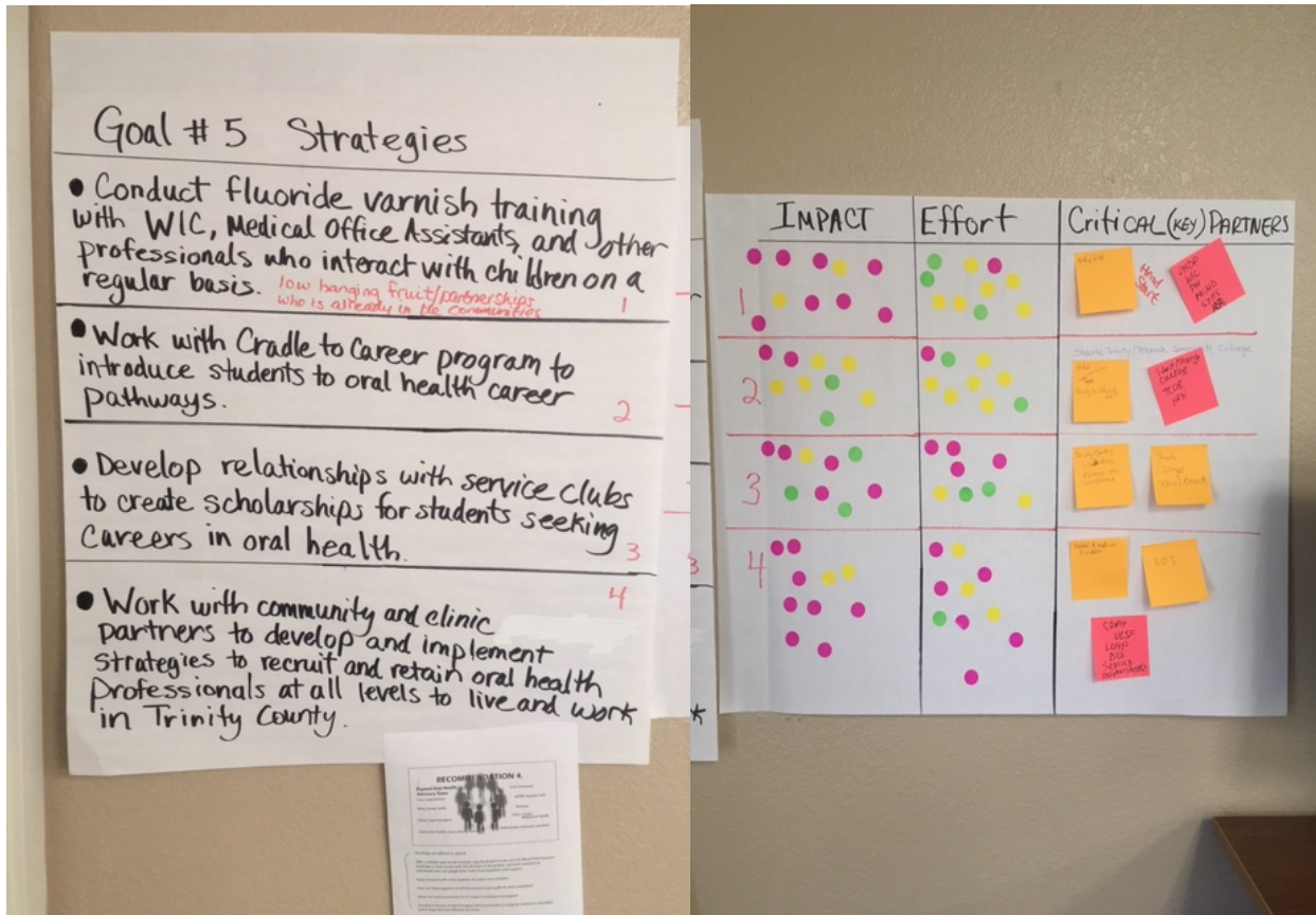
The photos above were taken at the Oral Health Advisory Committee meeting on September 12, 2019.