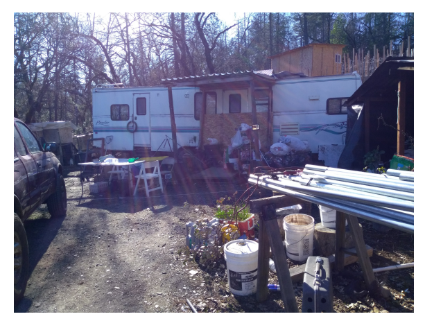
RV without RV permit and unpermitted addition