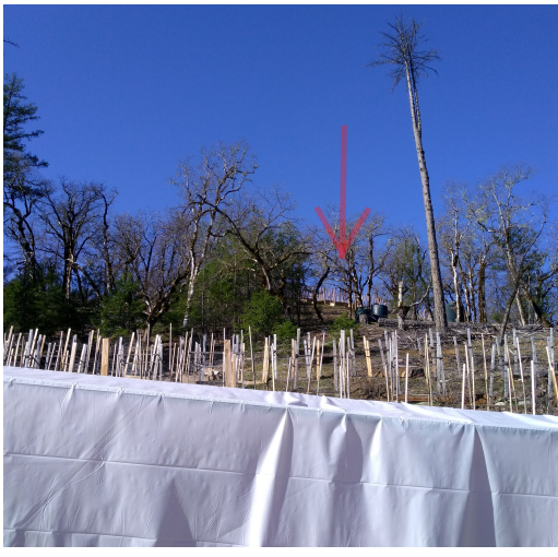
View of Upper Cultivation Site