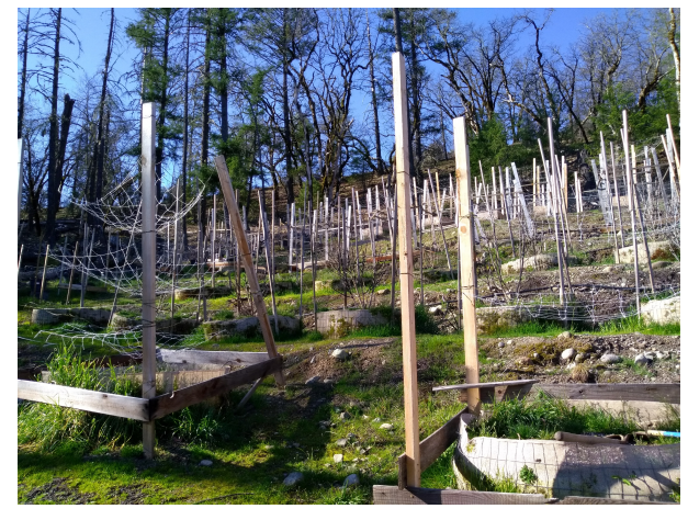
Current Cultivation Site Conditions

ATTACHMENT 4 Site Visit Photos APN 025-140-32-00 CCV-19-63 S. Xiong